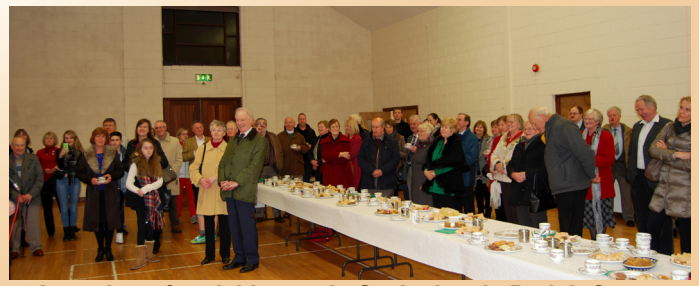
A section of parishioners in St. Andrew's Parish Centre after the church service.