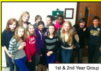
1st & 2nd Year Group Thursday from 7:00-8:00