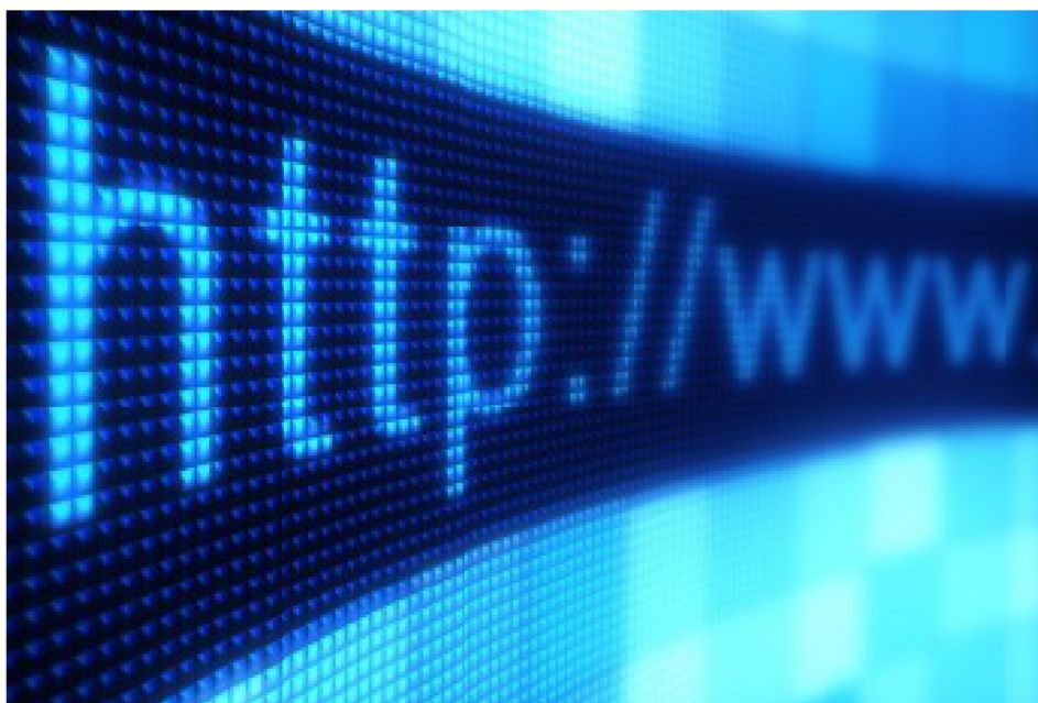
Our new Parish Web-site