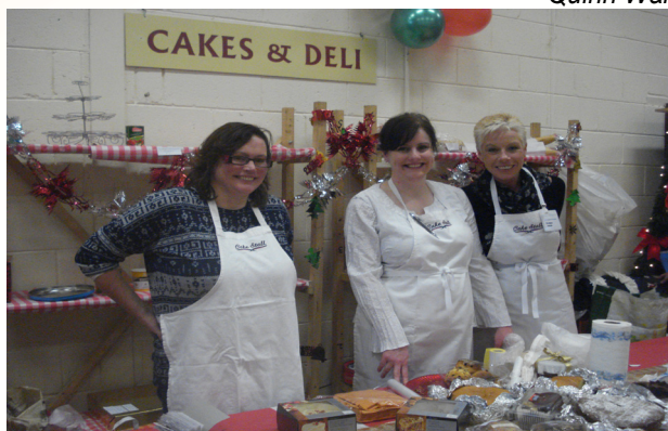
The Cake Stall.