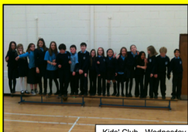
Kids' Club - Wednesday from 2:40-3:30