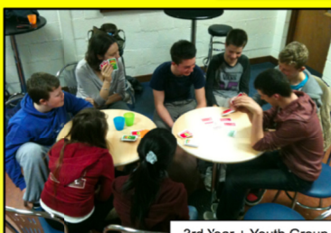
3rd Year + Youth Group Thursday from 8:00-9:15